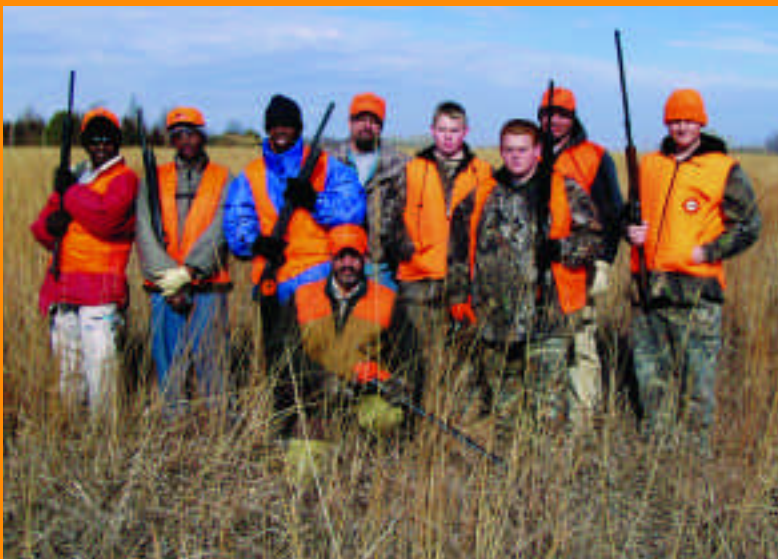
These are some of the hunters from the End of the Season hunt hosted by Ark Valley Quail Unlimited Chapter.

Through Pass It On, Littles receive instruction on conservation and safety issues. They have a unique opportunity to build respect for wildlife and, they gain a friend who will provide them with positive outdoor experiences.