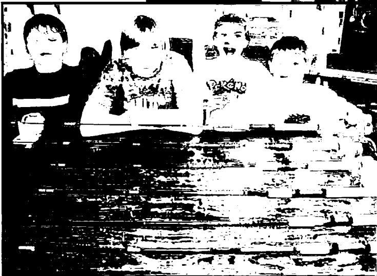
Four Proud BBBS "Littles".