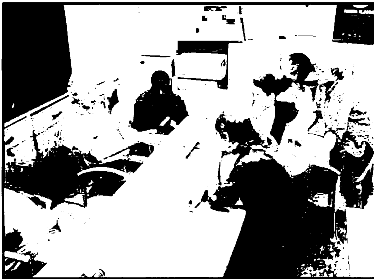
Neal Hall leading a Kansas BBBS session.