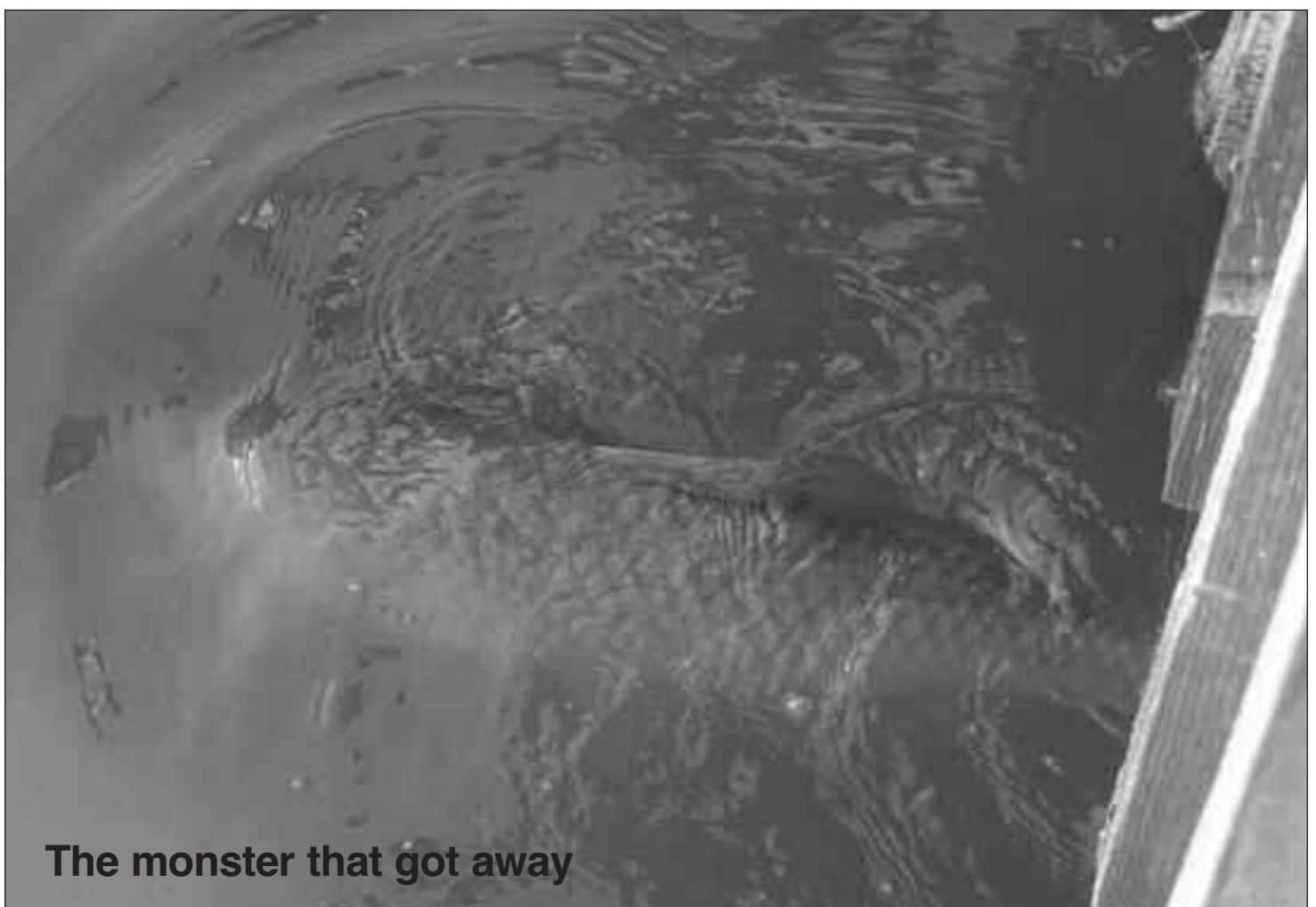
The monster that got away